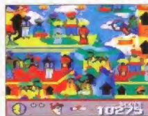
Kingdom of the Carpet Flyers